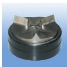
TRISATR PLUS Stainless Steel